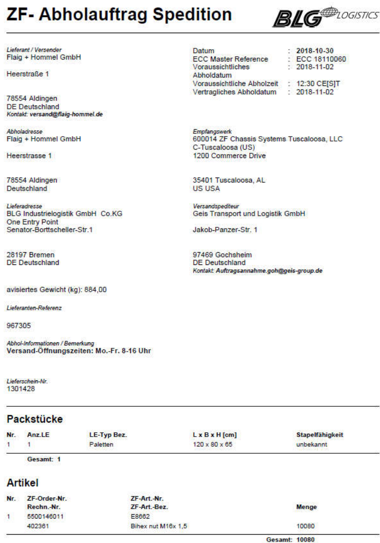
Figure 1: Sample transfer order