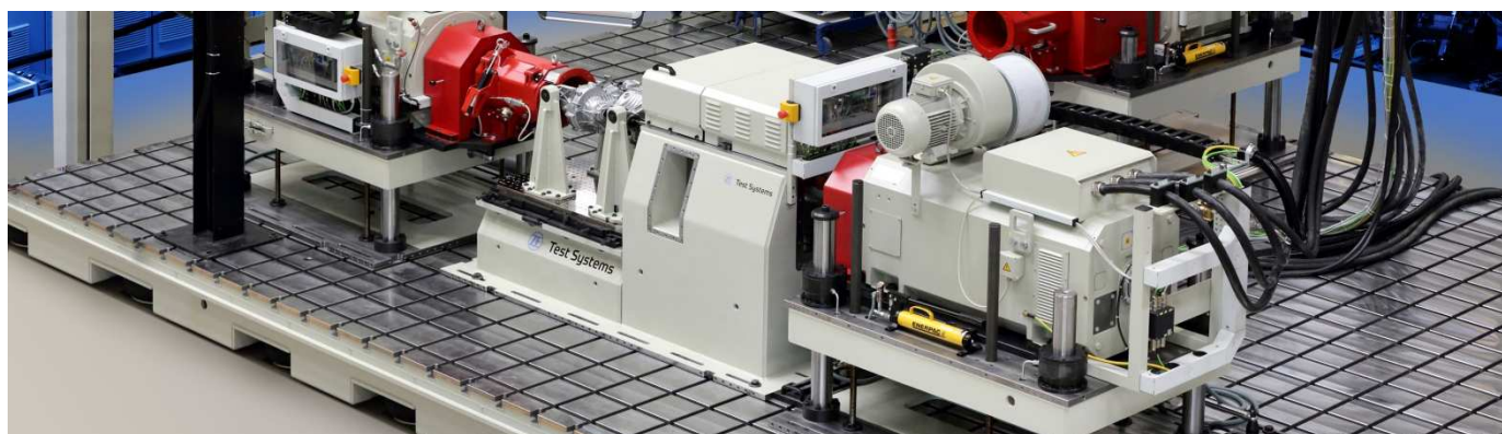
E-Mobility Test Bench: Future E-Mobility. Tested Now.