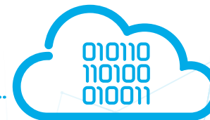
ZF IoT Cloud

In order to tailor the digital platform to customer requirements, ZF systematically and strategically expands partnerships with manufacturers, transport associations and other technology companies – for safe and reliable rail mobility.