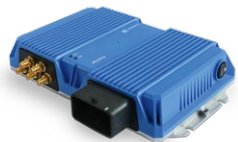
VCU Pro Onboard Unit Telematics gateway

With our innovative solutions, monitoring systems, and digital services, we support rail operators in permanent monitoring, early maintenance planning and predictive maintenance of their fleets. Thus, efficiency, reliability and safety in rail transportation can be further increased using integrated sensors and advanced data analysis tools.