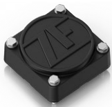
Heavy Duty TAG Wireless sensor