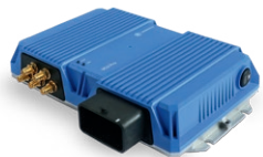
VCU Pro Onboard Unit Telematics gateway

With our innovative solutions, monitoring systems, and digital services, we support rail operators in permanent monitoring, early maintenance planning and predictive maintenance of their fleets. Thus, efficiency, reliability and safety in rail transportation can be further increased using integrated sensors and advanced data analysis tools.