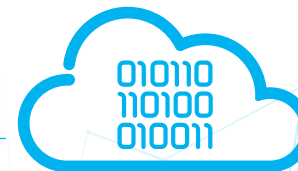
ZF IoT Cloud

In order to tailor the digital platform to customer requirements, ZF systematically and strategically expands partnerships with manufacturers, transport associations and other technology companies – for safe and reliable rail mobility.