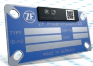
Smart Typeplate Digital typeplate