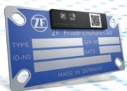
Smart Typeplate Digital typeplate