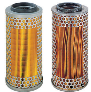
Genuine part Imitation

Insist on getting genuine spare parts from authorized service dealers for the maintenance of your machines.