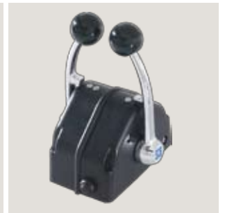
463 Control Head