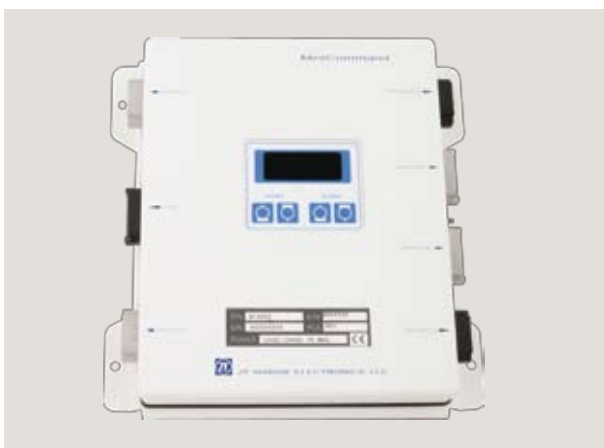
MI2002 MiniCommand Processor