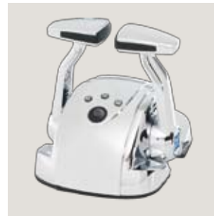
MC2000 Control Head